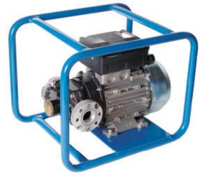
E120 in frame